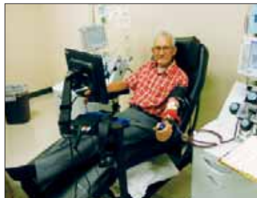
A donor gives blood at San Diego Blood Bank. It typically costs more than $150 to collect, screen and store blood.